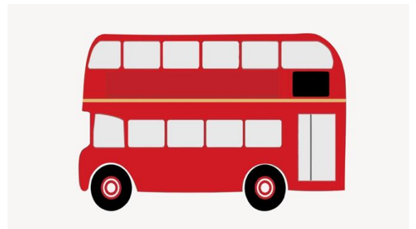
Double Decker Bus (Public Domain)

A second group (Bus Buddies 2) has been running for a year. Their trips are on Thursdays while ours are on Tuesdays. Who knows there might even be a Bus Buddies 3 in the future if there is sufficient demand!