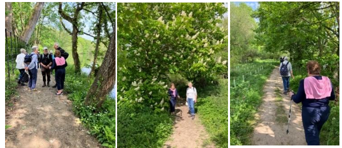
On the path to Eccleston Ferry

Our walk on May Day was again one we had done before. From the Grosvenor Arms at Aldford we walked along the river to Eccleston Ferry and back for lunch at the Grosvenor. May is normally a lovely month for walking; the weather was warm and sunny, and the path was at its prettiest, as you can see from the photos.