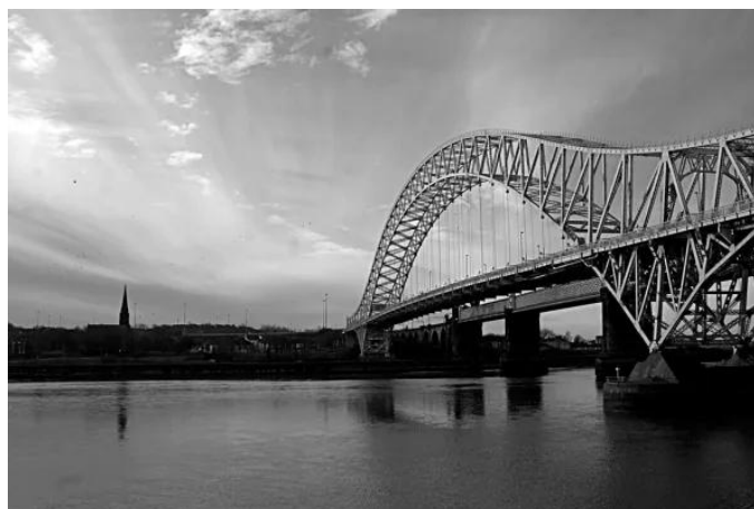
"THE SILVER JUBILEE BRIDGE CHESHIRE"