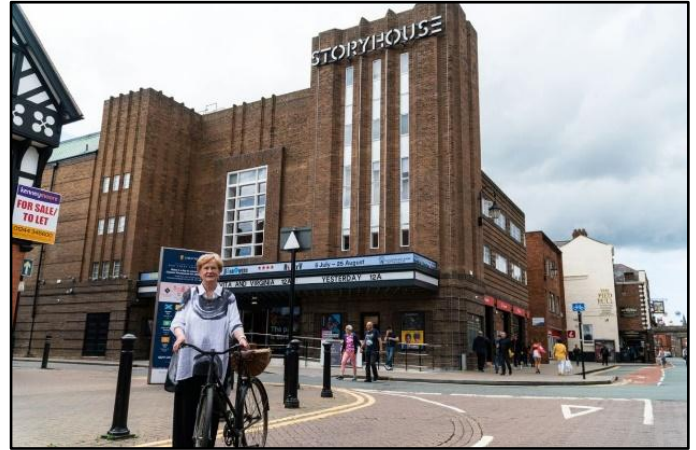
A more recent picture of May with her bike