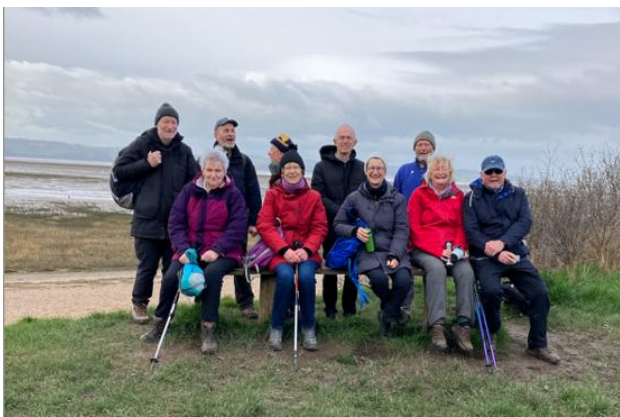
Heswall Dales – taking a break on a handy bench

One of those favourites is the heathland at Heswall Dales. For our walk in March, we started from the Jug and Bottle in Heswall, made our way through various green spaces to the Dee estuary and followed the shoreline for about a mile before turning up through Heswall Dales back to the pub.