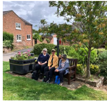
A well-earned break at Dunham on the Hill

Our early June walk was new to the group. From the Bluebell Café at Great Barrow, we headed east then north, along paths, through several hayfields full of buttercups, and past a number of farms, with a few diversions to avoid cattle. We stopped for a break at the pretty village green at Dunham on the Hill; the gents chose the wall while the ladies chose the comfort of a bench; there is a second bench with a charming dedication to the man who used to mow the green. We then returned south on lanes and more fields back to the Bluebell Café for an excellent lunch. This was a lovely quiet traffic-free walk with “wildlife” which included llamas, a donkey, chicken, horses and cattle.