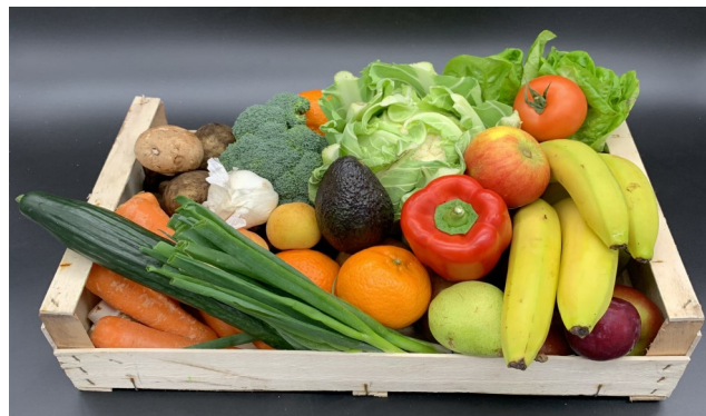
Hoole Food Market