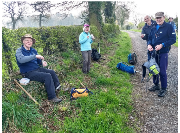
Some Wednesday Walkers, celebrating release from lockdown

NB: if you wish to do this walk please note that the above is not intended to be a step-by-step guide. You should go appropriately equipped, eg with a map, keep to footpaths with rights of way, and observe current covid guidelines.